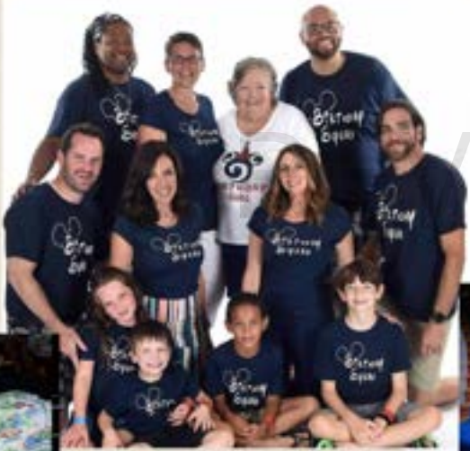
We went on a Disney cruise for her 70th birthday. We can't wait to do it again!